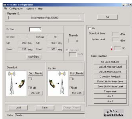
PC repeater configuration software