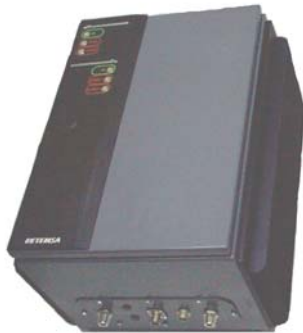
MODEL DCSR14H-XXXC2S GSM 1800 MHz / 33 dBm 2 channels