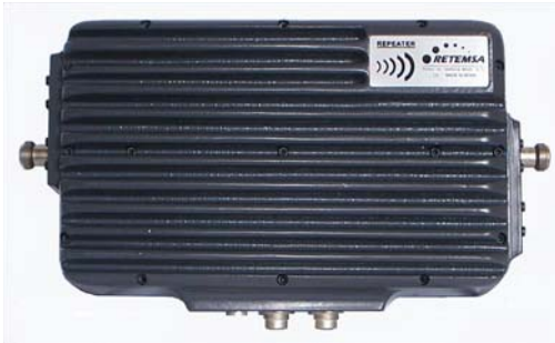
MODEL DCSR14H-XXX GSM 1800 MHz / 23 dBm