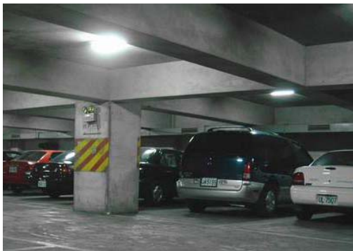
Quick deployment and cost effective coverage indoor applications.