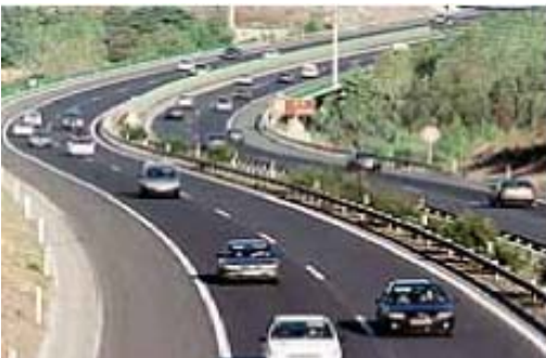
Quick deployment and cost effective coverage outdoor applications.