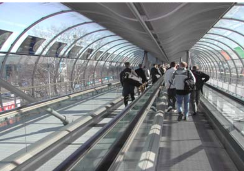
Quick deployment and cost effective coverage indoor / outdoor applications.