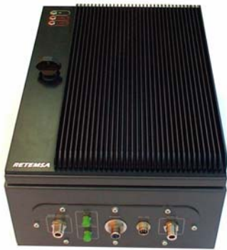
MODEL PCSR14H-XXXT GSM 1900 MHz / 33 dBm